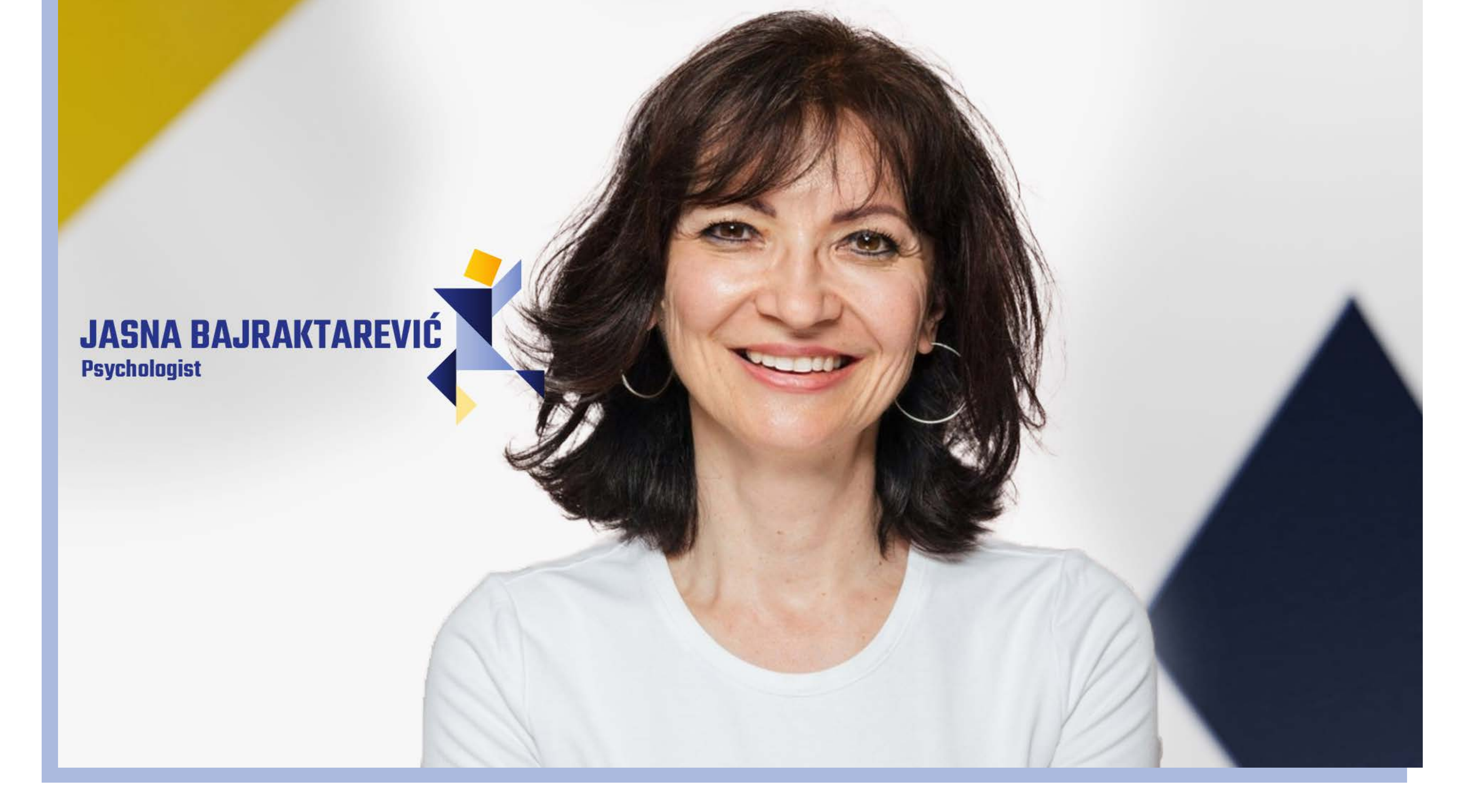
INTERVIEW STUDIO SETUP