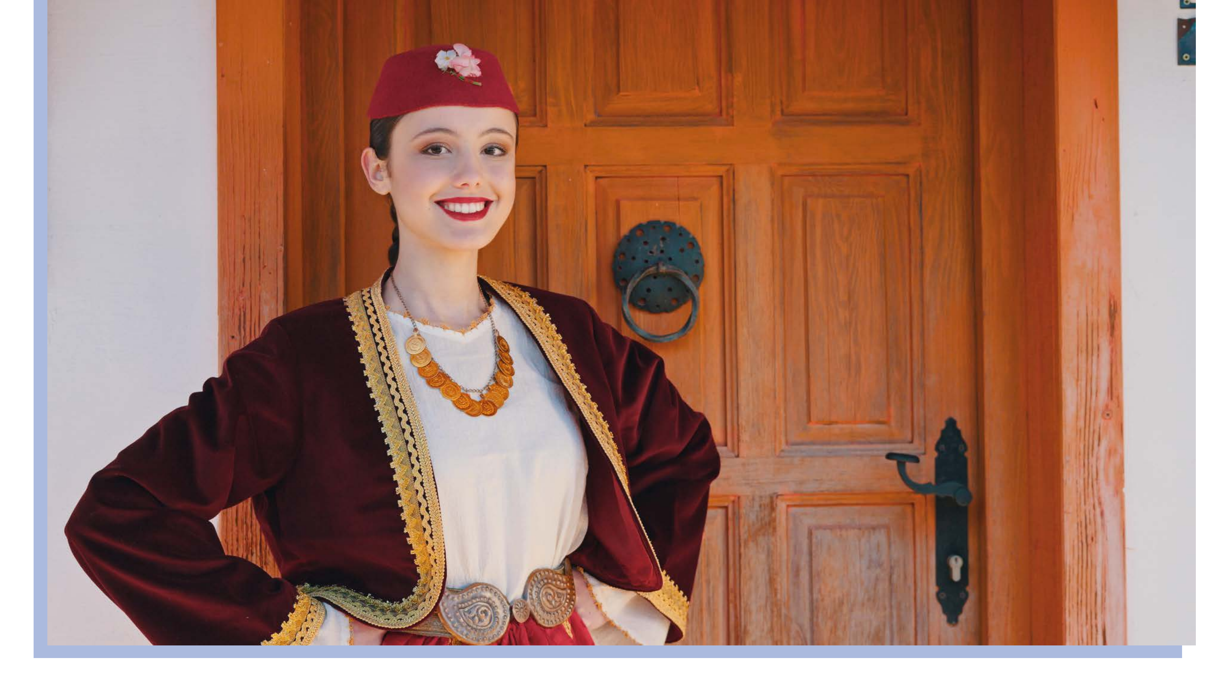
Woman in traditional clothes smiling.