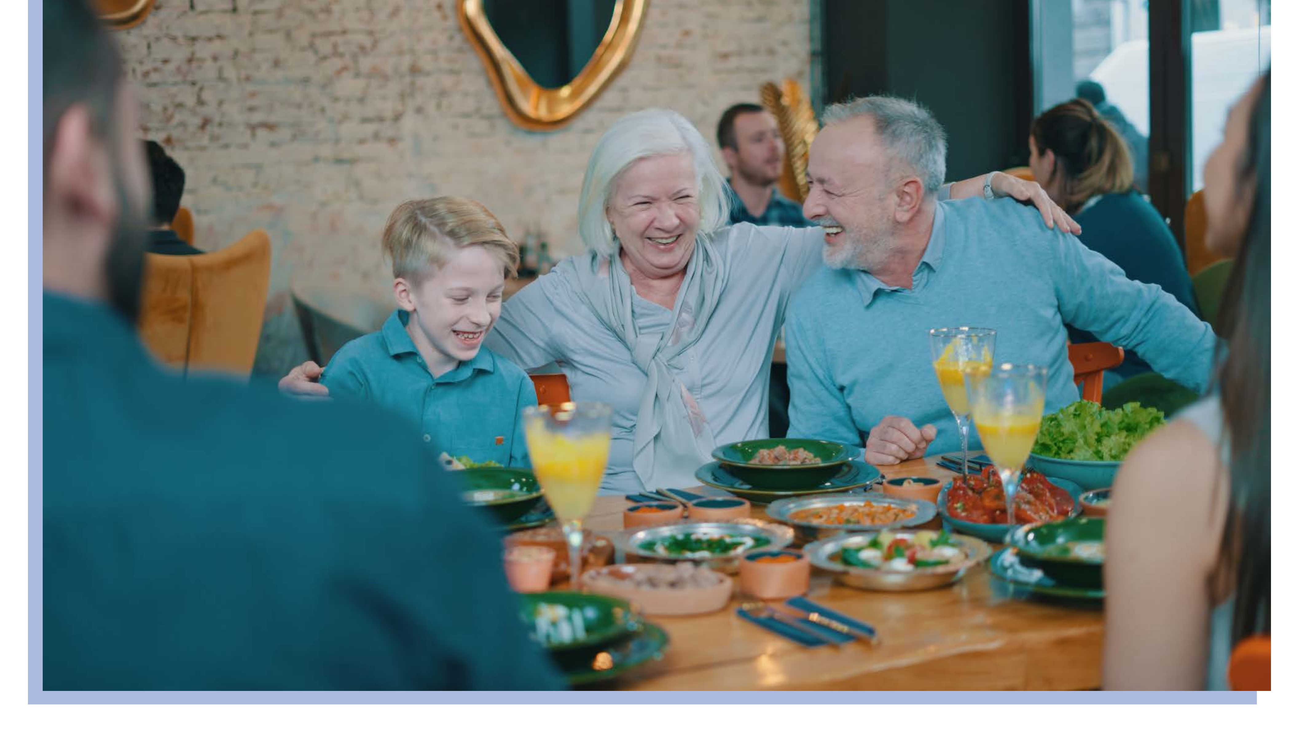
Happy family eating traditional bosnian food.