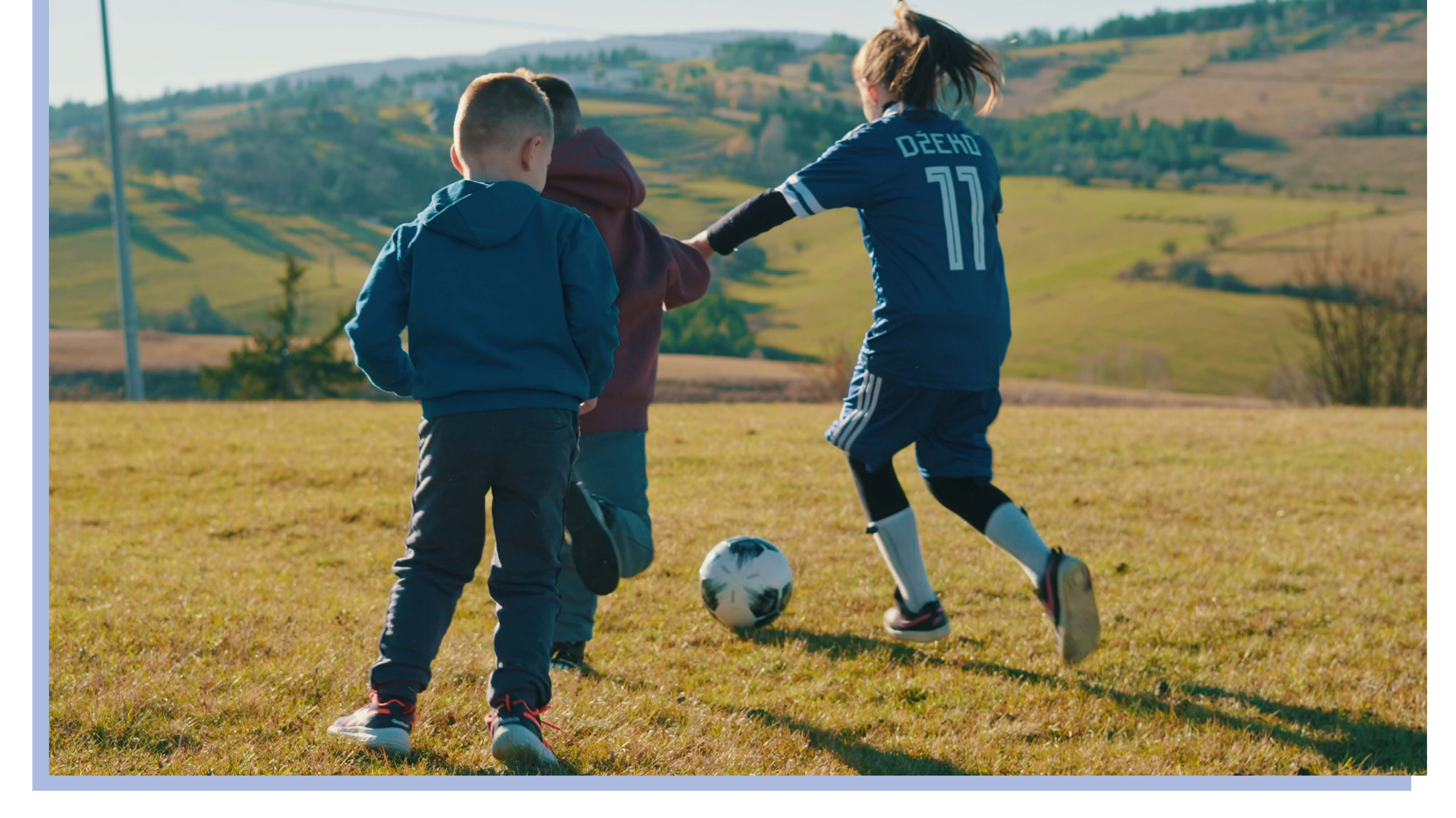
Children playing football on the grassy field.