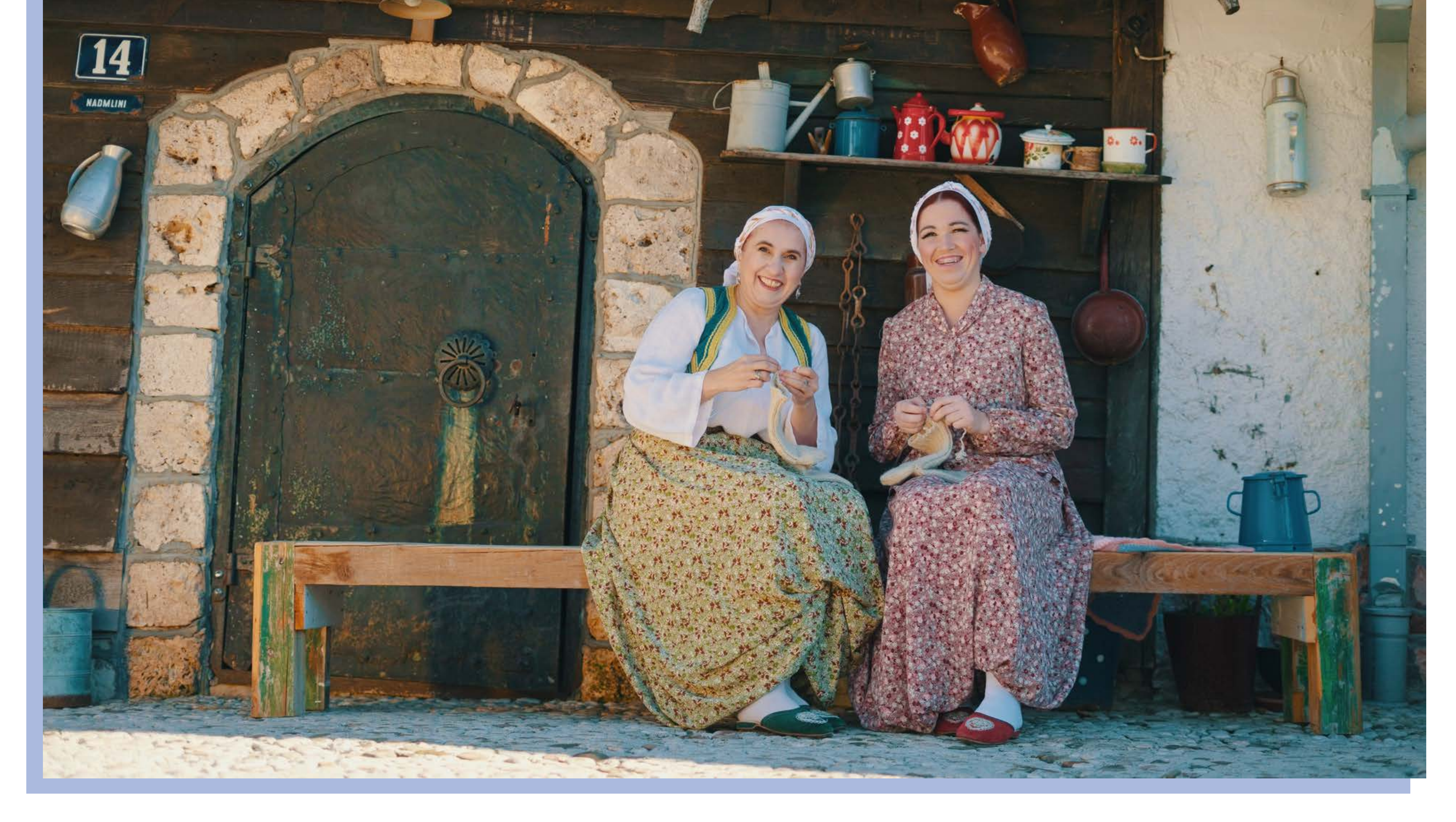
Shot of two happy women in traditional Bosnian clothing.