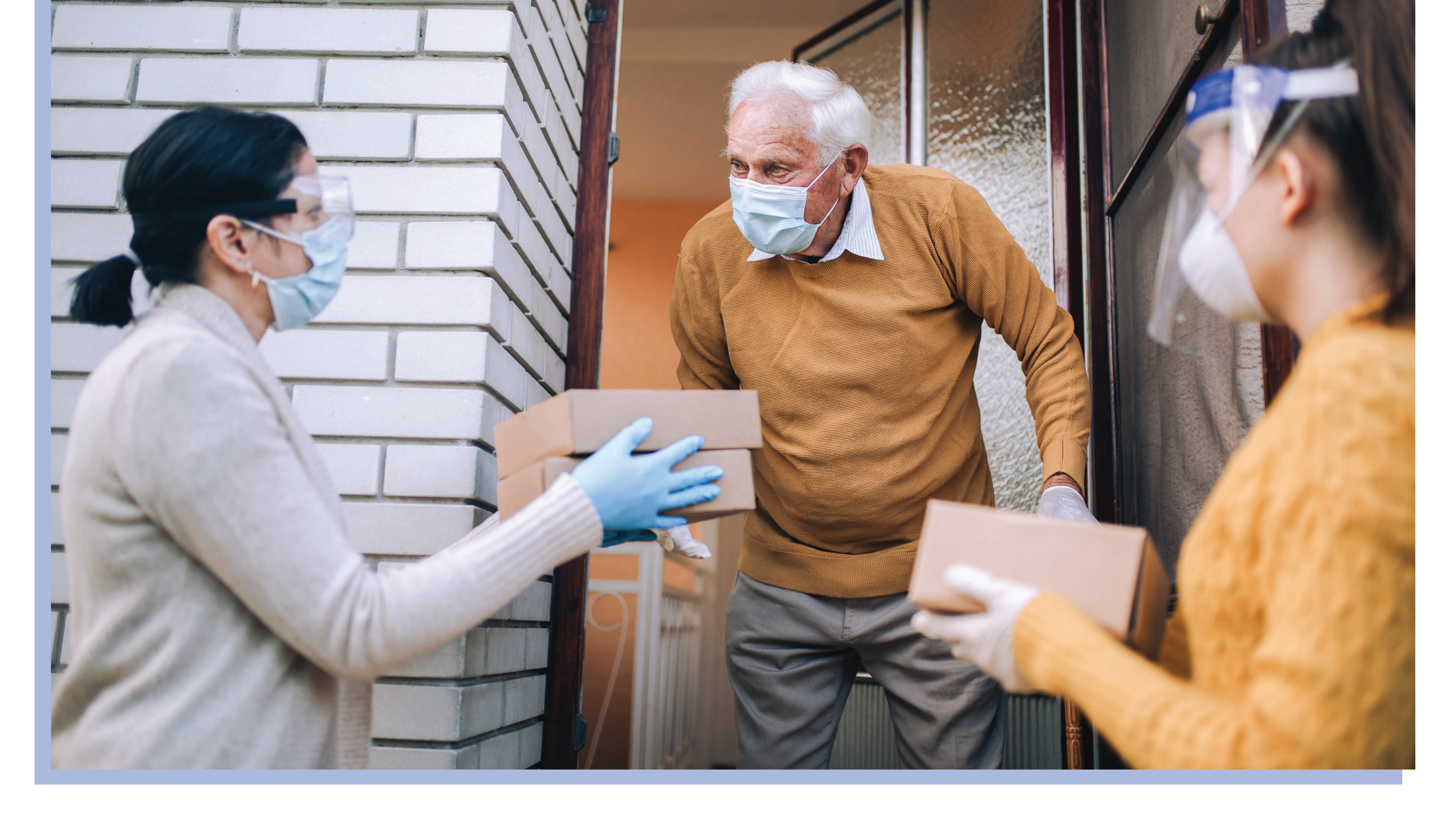
SHOT OF VOLUNTEERS HELPING ELDERLY MAN.

MIRSAD COVID-19 has put the spotlight on this inequality. It also showed how broad and complex the issue of fair access to health service is.