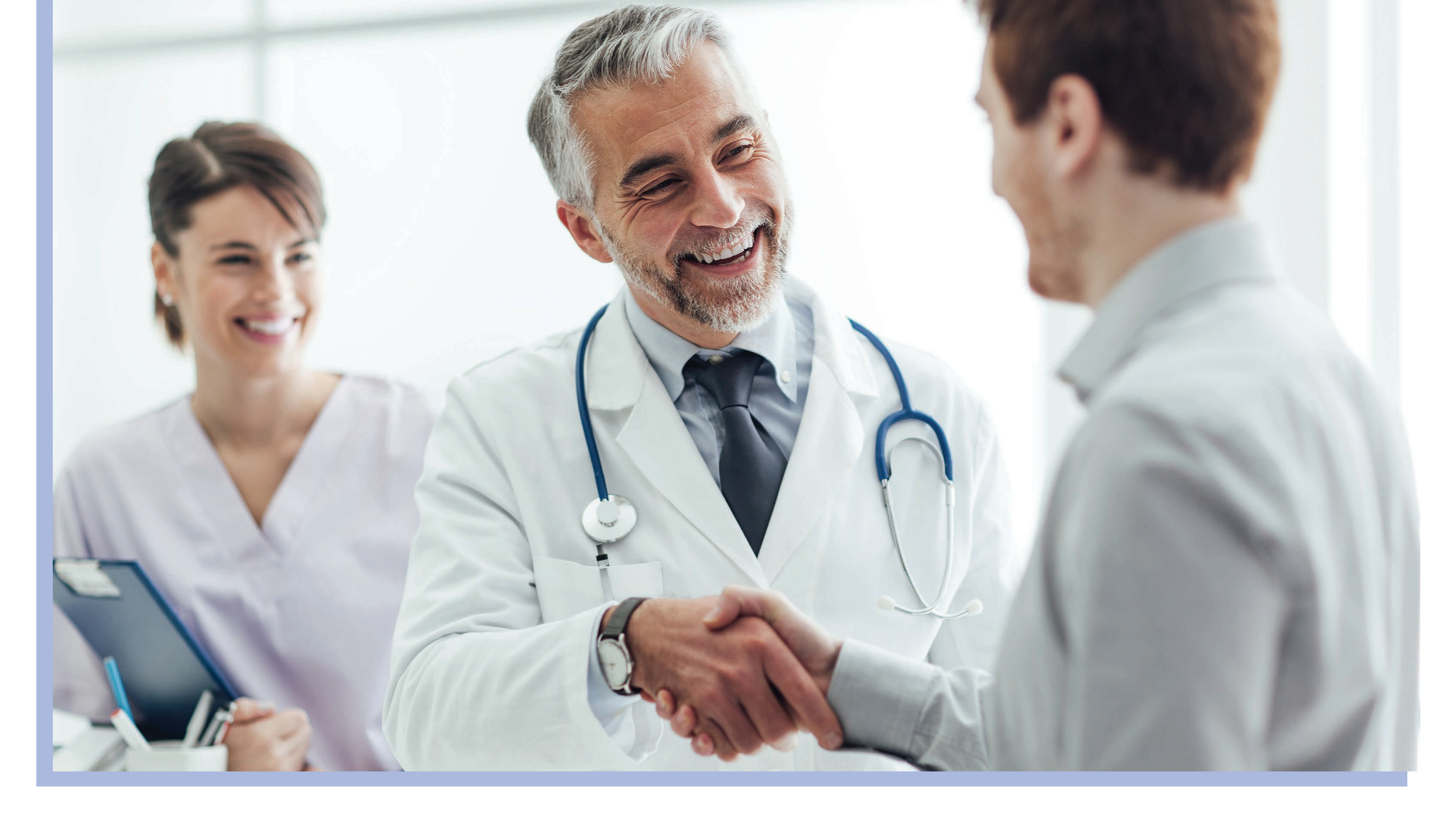
SHOT OF HAPPY PATIENT AND DOCTOR SHAKING HANDS.

MIRSAD Access to health care should not be determined by a person's birth and social status. Everyone deserves adequate and professional medical care.