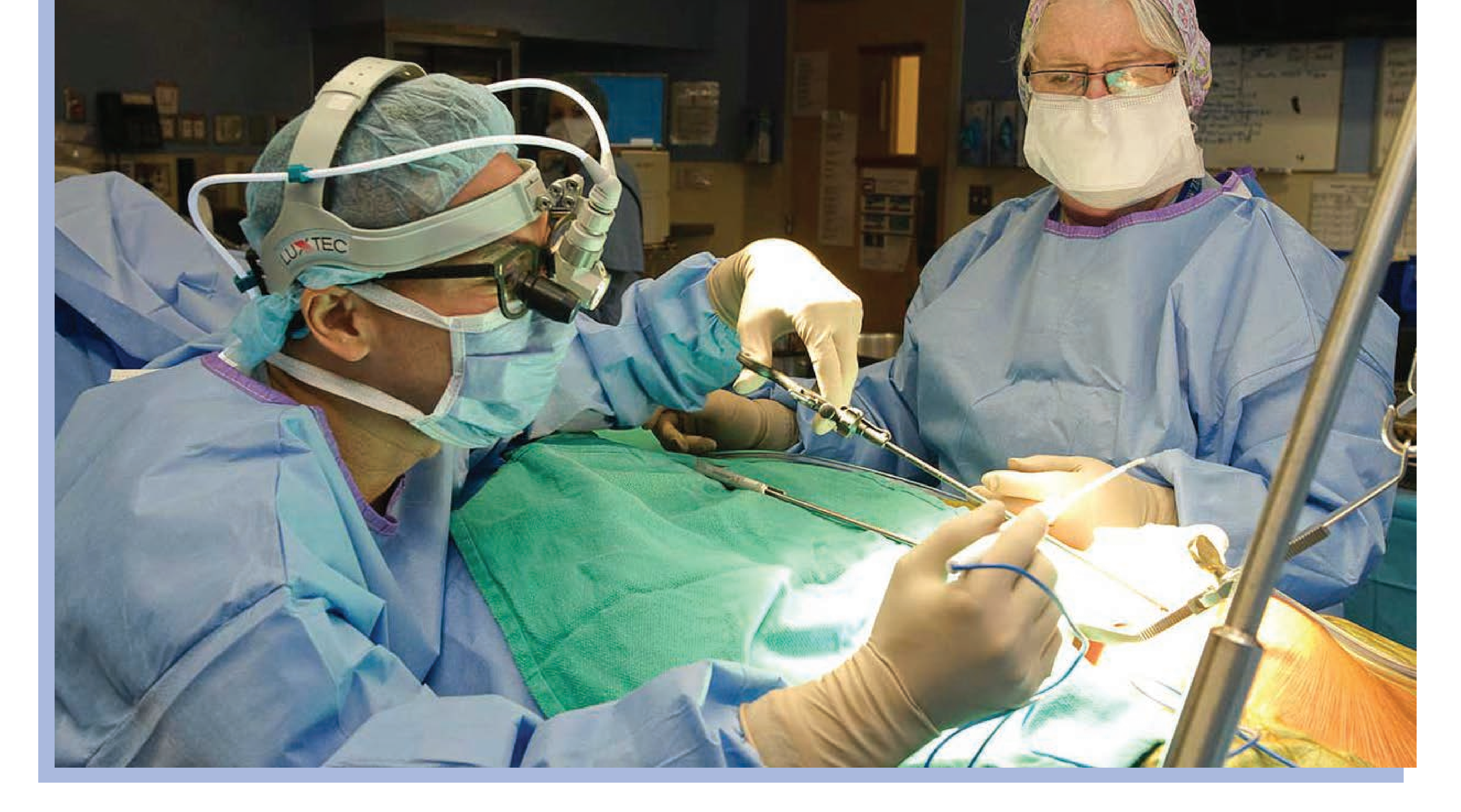
SHOT OF SURGEONS INSIDE THE OPERATING ROOM.